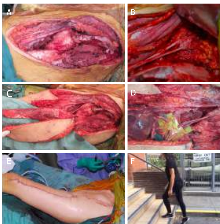
Figure 2. Example of lower limb functional reconstruction with functional muscle transfer, nerve grafts and nerve transfers in a 30-year-old female. A: large defect to left groin following excision of sarcoma, which included femoral nerve and iliopsoas and sartorius muscle resection, also demonstrating exposed femoral artery and vein; B: nerve grafts performed using cutaneous femoral nerve branches, from proximal stump to quadriceps branches; C: pedicled, innervated rectus femoris myocutaneous flap raised prior to inset to reconstruct hip flexors; D: adductor longus nerve transfer to vastus medialis oblique branch; E: final result after inset and closure; F: patient had full return of hip flexors and quadriceps function, and was able to run, climb and descend stairs at 18 months (see Videos 2 and 3 )