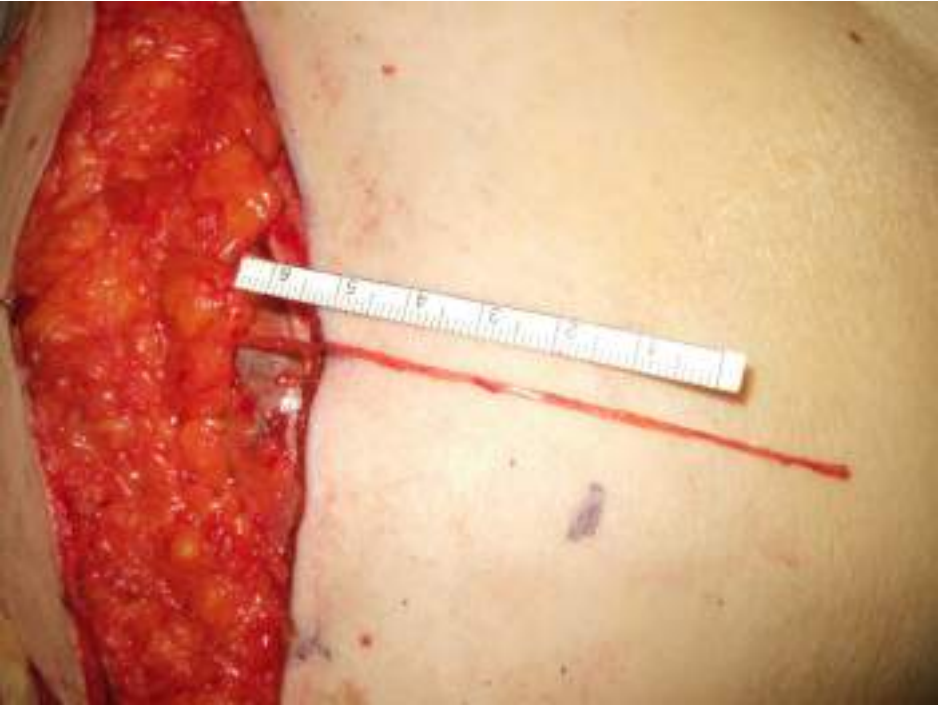
Figure 5. Innervated rectus abdominis myocutaneous flap harvest with good length of intercostal nerve available through a standard approach