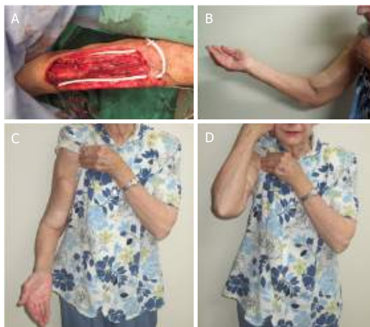
Figure 1. Clinical images of functional upper limb reconstruction with a combination of free functioning muscle transfer and nerve transfer in an 83-year-old patient. A: right arm defect following sarcoma excision including 100% of biceps and over 50% of brachialis, which was denervated. This was reconstructed with a free innervated gracilis myocutaneous flap with the nerve coaptated to the cut end of the musculocutaneous nerve, along with a flexor carpi ulnaris branch to brachialis branch nerve transfer; B: results after 12 months, demonstrating very good cosmesis and contour; C, D: active elbow flexion from 110° to 40° with M4 power (see Video 1 )